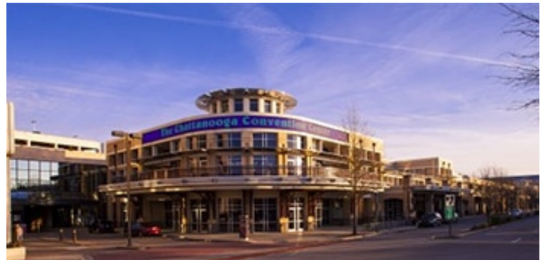
Chattanooga Convention Center

As of last month the convention was getting close to 460 vendor tables reserved. This is by far the most ever seen at an IPMS National Convention. So bring lots of cash!!!